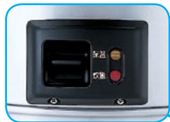
Automatic keep-warm function